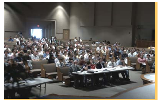
Approximately 300 attended the seminar

God created man in a way that his mind is formed by standards of values on which he base his decisions to live in a certain way. As for Christians, the only standard and source of value – God and His truth! Only by God’s grace and by His precise and active work of Holy Spirit we are able to transform our characters to truly become like Christ – it’s a blessing, it’s our ultimate JOY!