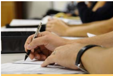
30 students are on the way to first semester of Theology 1

We praise Lord for The Master's Seminary's offer to purchase their 4 Theology DVD courses for theological training for our Bible Institute. Thirty (30) students that possess good English have started first semester of Theology I, which began on September 6. This will be a 2-year program, total of 4 semesters, which will enrich each student to understand fundamentals of Systematic Theology, helping them to grow in the knowledge of God. This course is a very important step in training of a new generation of Russian-Americans church leaders.