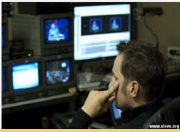
WGBI's live broadcast services

In the last couple of years, we have experienced tremendous blessings through the opportunity to broadcast our Sunday and Wednesday services and some of the WGBI classes live. It is great a way to penetrate the Russian-speaking world with sound Biblical teaching. For thousands of people in different parts of the world, our broadcasts have become the only source of the real spiritual food. To be able to continue this ministry and make it more effective, it is necessary for us to buy a new video controller. The one that we use now is outdated and can fail any time; in which case, broadcasting our services will become impossible. The cost of a new video controller is around $27,000, without any additional minor expenditures in connection with this new controller. The new controller will not only raise the quality of our broadcast, but it will allow quality display of charts and graphs, which we use extensively during our classes and sermons. We would like to share a few testimonies of our live stream listeners with you: