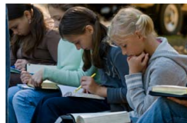
Teem camp "The Fear of God"

The need for evangelizing and shepherding younger generation – very demanding! This year about 400 children and youth participated in camps, with about 100 volunteers serving them. As a result of this ministry, about 20 campers accepted Christ, hundreds of those who already know the Lord had grown in their knowledge of Him, carrying the light of the Biblical truth into the world of their lives. We pray that the Truths learned will dwell in their hearts as they face numerous temptations and fleshly desires the world offers and that the Truth will be the only "weapon" to help them overcome these barriers. Also, we pray that the sanctification process will never stop in lives of counselors and leaders, as they learn how to strengthen their shepherding skills and that they continue to imitate on Truth and live by it.