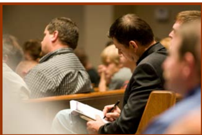
The discipline of mind.....

“AN EFFECTIVE LEADER WILL USE EVERY OPPORTUNITY TO DISCIPLE OTHERS”