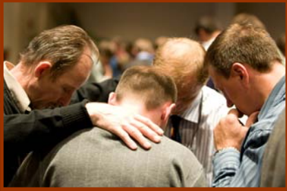
Sincere prayers & word of commitment.....

“O God, You are my God; Early will I seek You; My soul thirsts for You; My flesh longs for You...” These words from Ps. 63 were part of the opening statement of the Real Men conference that took place at Word of Grace Bible Church on October 17-18, 2008. Although men usually are associated with strength, the lack of the true manhood and real leadership abilities makes them one of the weakest elements of modern-day families, churches, and society as a whole.