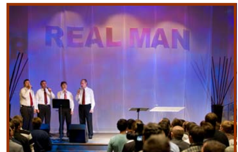
“...I rest in His name...”

“There is no one more precious than Christ; I rest in His name; I long to be with Him always, for my soul He is very dear” – these words of the closing hymn still resonate in the hearts and minds of many participants of the conference. Let’s pray that every one of them would really become a true man of God.