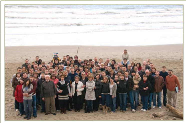
115 people prayed about different ministries of WGBC

This event was definitely a very important step in the process of spiritual growth for every one, who was a part of it.